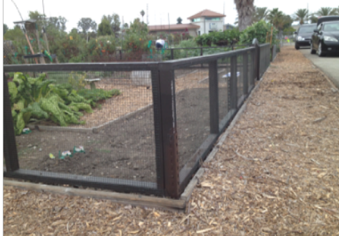
Example of Optimal Fencing #3

6) Any new plot fencing must be pre-approved, both in design and materials, by the 1 st Vice President