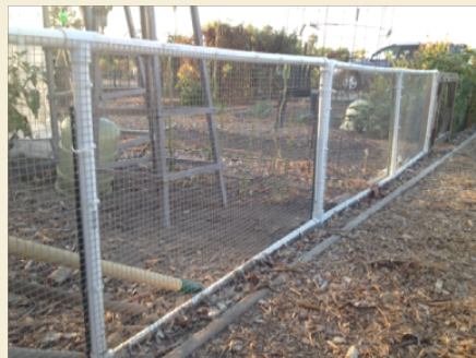
Example of Optimal Fencing #1

Cost to build a stable fence will vary depending on materials used: basic wood fence with gate is estimate to cost a minimum of $200; PVC will start at around $350. Walk around the gardens and look at existing fences but a few optimal examples are: