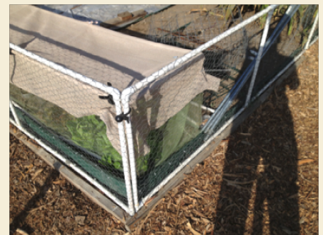
Example of Optimal Fencing #2

If you are unable to install the fencing described above, modified fencing forms can be used, such as simple stakes and fencing. However, consider the safety and durability of these types of fencing. For example, rebar alone can be dangerous if someone falls on it so cover it with PVC or other material. Plastic fencing is prohibited and fencing cannot impede the pathways.