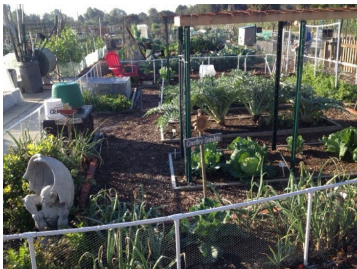
Garden O-01 Lisa Owen