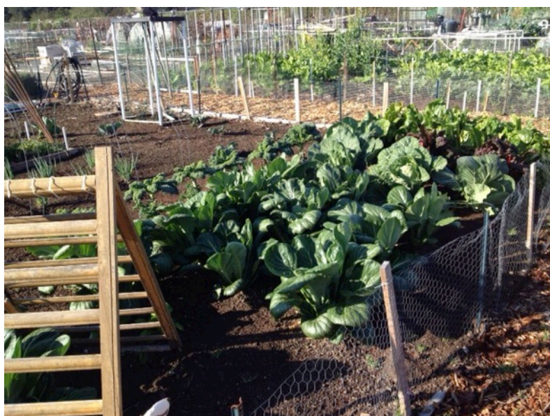
Garden K-03 Maryann Jarvis