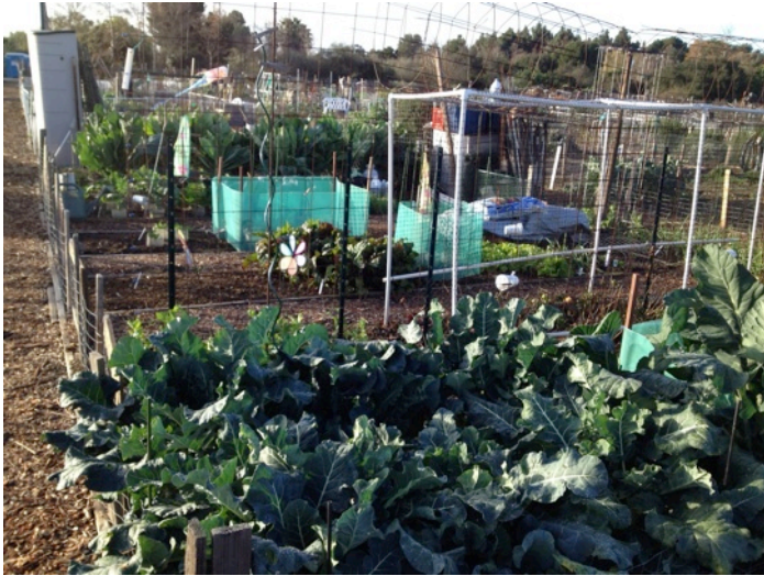
Garden B-13 Nigel Hill